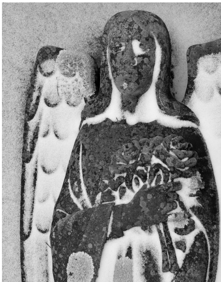
Monochrome Print by Alan Forney